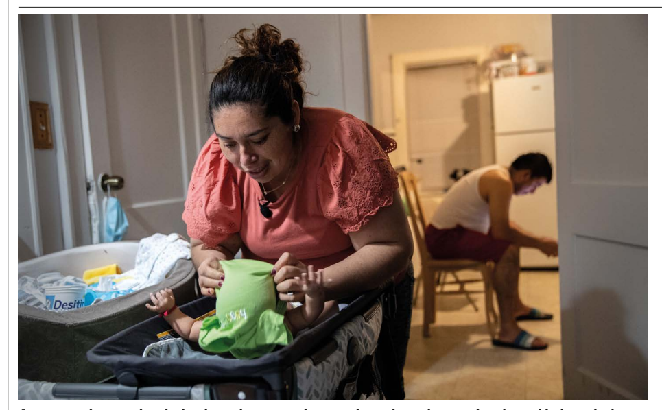
A woman dresses her baby, born by caesarian section when she was intubated in hospital.

crosses from mother to fetus. However, some preliminary data suggest that infection with the virus can damage the placenta, possibly causing injury to the baby.