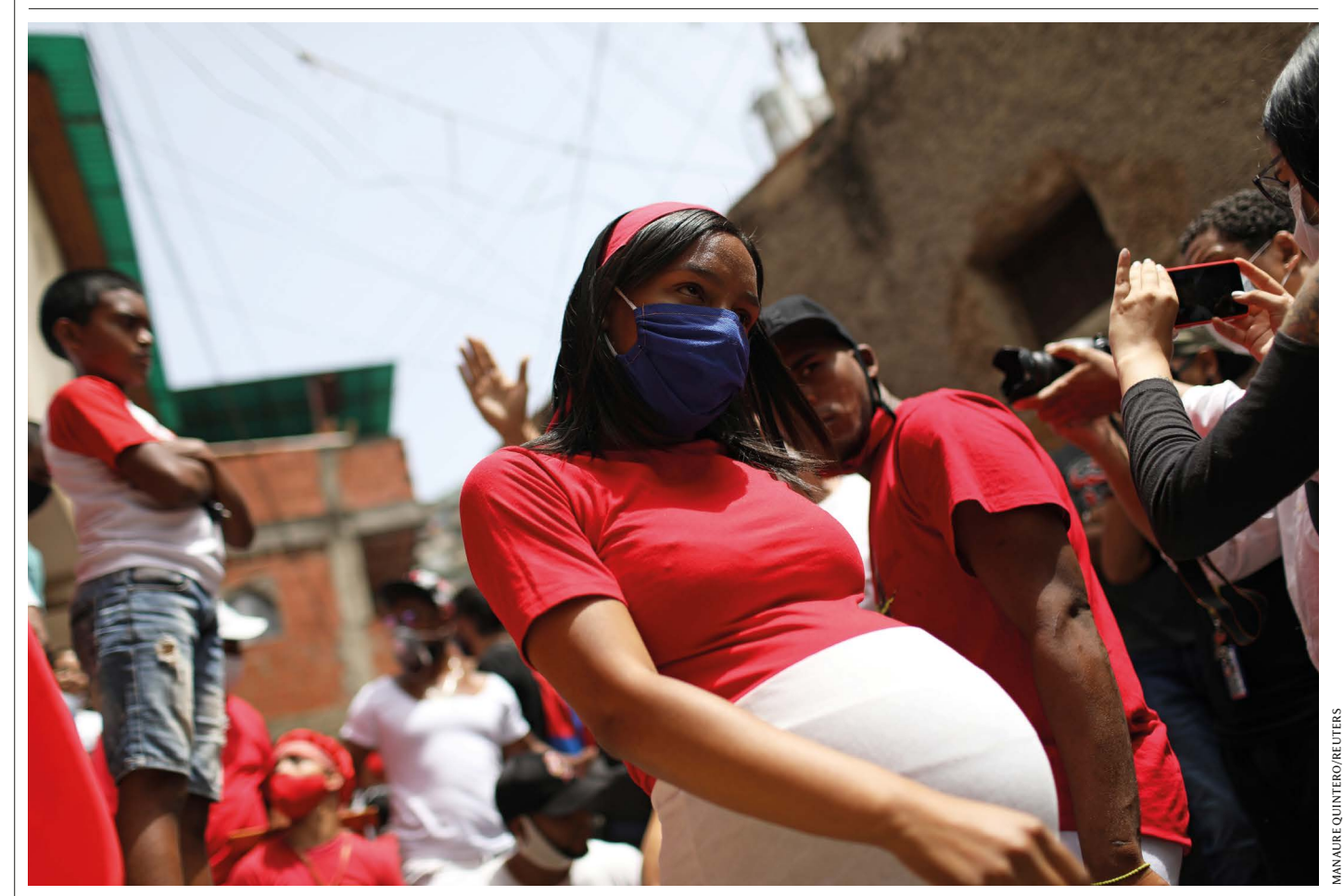
A pregnant woman attends a celebration in Caracas. Data show that pregnant women face increased risks from SARS-CoV-2 infection.