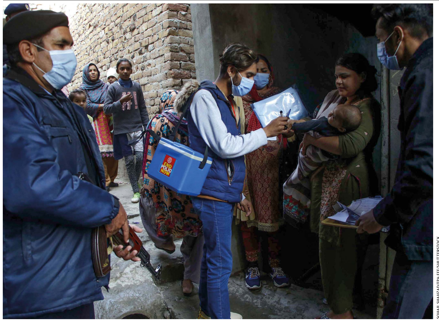
Health workers administer polio vaccine to children in Islamabad in January. An armed police officer stands nearby to protect the vaccinators.