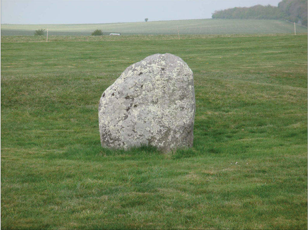
Figure 7. Surviving Station S93 at the south-west corner of the Station Stone Rectangle.

The core of the year is represented by the Sarsen Circle. Here, each of the 30 uprights represents a solar day within a repeating 30-day month. Running sun-wise from the main axis, with S1 representing Day 1, S11 and S21 become significant, as they divide the month into three ‘weeks’ or ‘decans’, each of 10 days; the anomalous stones mark the start of the second and third decans. Twelve monthly cycles of 30 days, represented by the uprights of the Sarsen Circle, gives 360 solar days. While no stones within the central setting can specifically be identified with the 12 months, it is possible that the poorly known stone settings in and around the north-eastern entrance (Cleal et al. 1995: fig. 156) somehow marked this cycle.