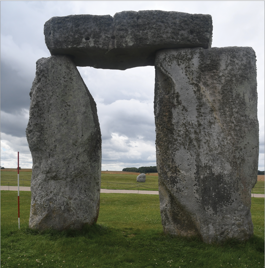
Figure 3. Small-sized sarsen stone S21 (left) in the Sarsen Circle, with the normal-sized S22 to the right. View looking outwards from inside the circle. Scale = 2m.

eastern sector is notably narrower, at 1.1m wide; it is also thinner and shorter than most, although recent work suggests that its top has been broken off (Abbott & Anderson-Whymark 2012: 50). S21 (Figure 3) in the western sector appears complete but is narrower, at 1.5m wide, and thinner than average. Figure 4 shows the pattern of stone widths and gaps around the circumference of the Sarsen Circle. Although the six missing uprights lie in the south-western sector of the circle, the size of their sockets—known through excavation or parch-marks—suggest they were ‘standard width’ stones. Counting sun-wise from S1, there seem to be three distinct groups of ten uprights: S1–10, S11–20 and S21–30. Each group is preceded by a slightly wider-than-usual gap, with S11 and S21 standing out due to their smaller size.