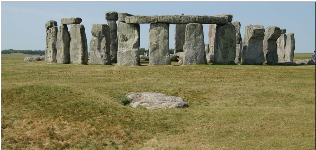
Figure 1. Stonehenge, viewed from the north-east, showing the post-and-lintel construction of the Sarsen Circle (photograph by T. Darvill).

The most visually prominent structure at Stonehenge is the ring of 30 upright sarsen stones, linked at the top with 30 lintels (Figure 1). The uprights are conventionally numbered S(tone)1 to S30 in clockwise fashion, starting at the north-east. Seventeen of the uprights are still standing in their original positions, seven are extant but fallen and six are missing. Six lintels remain in place atop their supporting uprights, while two fallen examples lie on the ground; 22 are missing. Although the missing stones have sometimes been suggested to indicate that the Sarsen Circle was never completed (e.g. Ashbee 1998), sockets for some fallen or missing uprights are known through excavation (Cleal et al. 1995: 192–