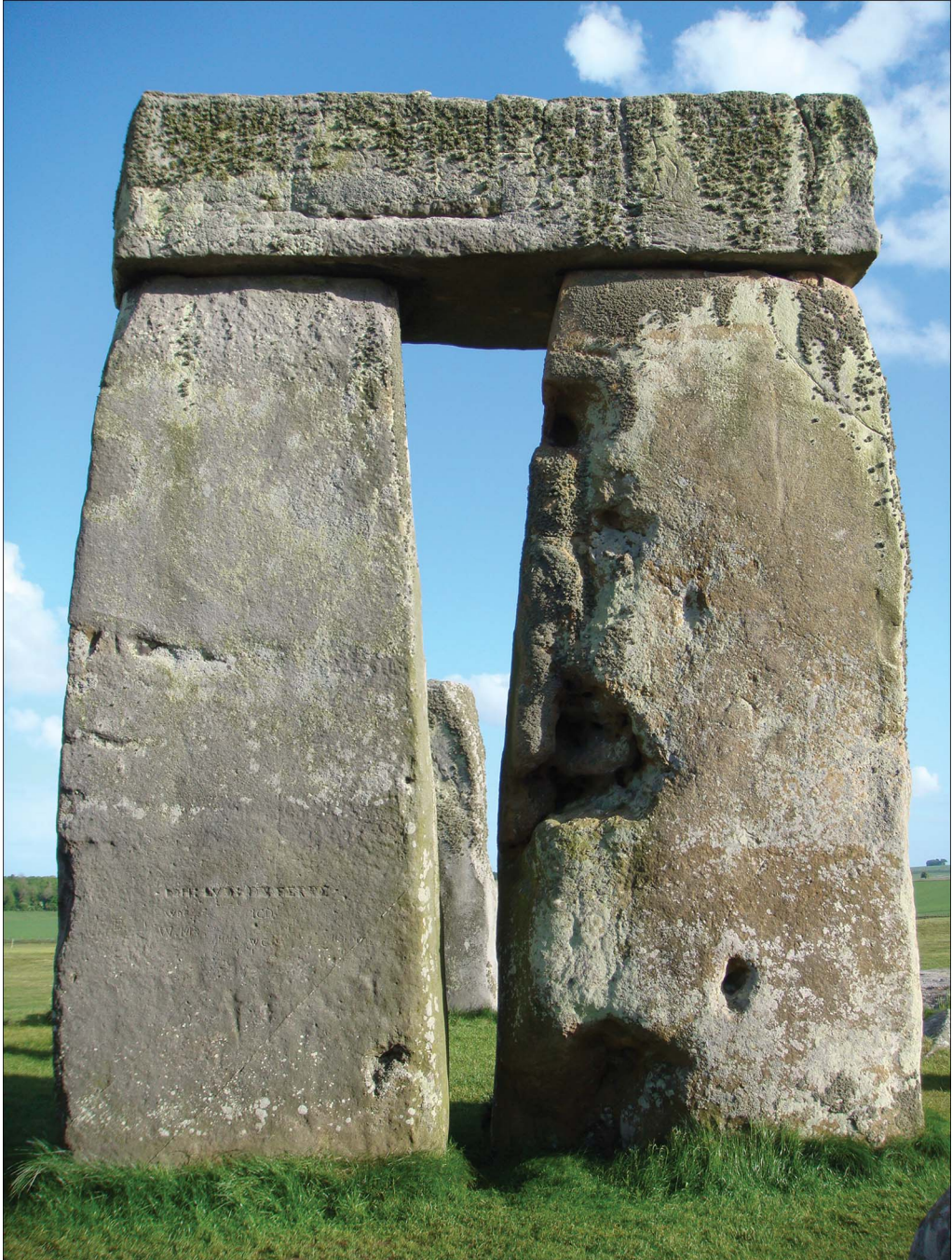
Figure 5. Trilithon S53 and S54, with lintel S154, showing contrasting pairs of smoothed and rough uprights. View looking outwards from the inside of the Trilithon Horseshoe.