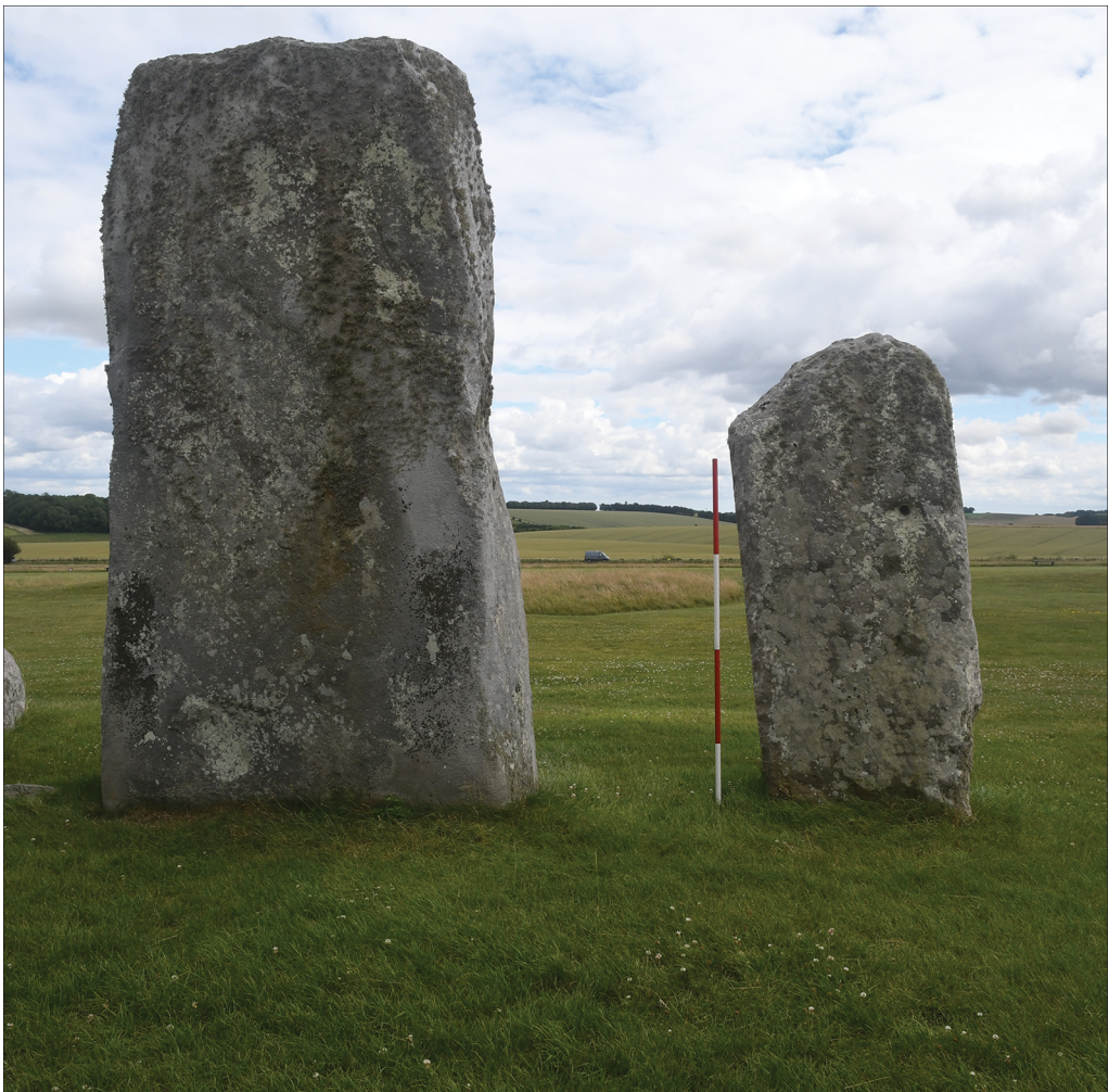
Figure 2. Sarsen stone S10 (left) in the Sarsen Circle, with the small-sized S11 to the right. View looking outwards from inside the circle. Scale = 2m.

The extant Sarsen Circle demonstrates the intricacy of its construction. The spacing of the pillars is fairly regular, but the gap between S1 and S30 to the north-east is larger than average, at 1.38m, suggesting that this was an entrance; as S15 is missing, it is difficult to judge whether there was a correspondingly wide gap to the south-west. Most of the uprights are uniform in shape and size, the 'standard width' being approximately 1.9m, measured 1.5m above ground level. Two uprights, however, stand out. S11 (Figure 2) in the south-